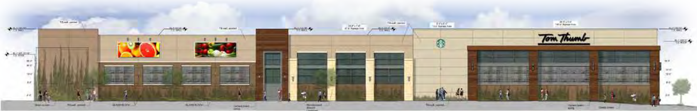
North Elevation – Grocer (view from grocer Parking Lot.)