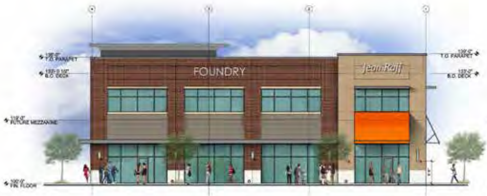
North Elevation – Retail Building B (view from Parking Lot)