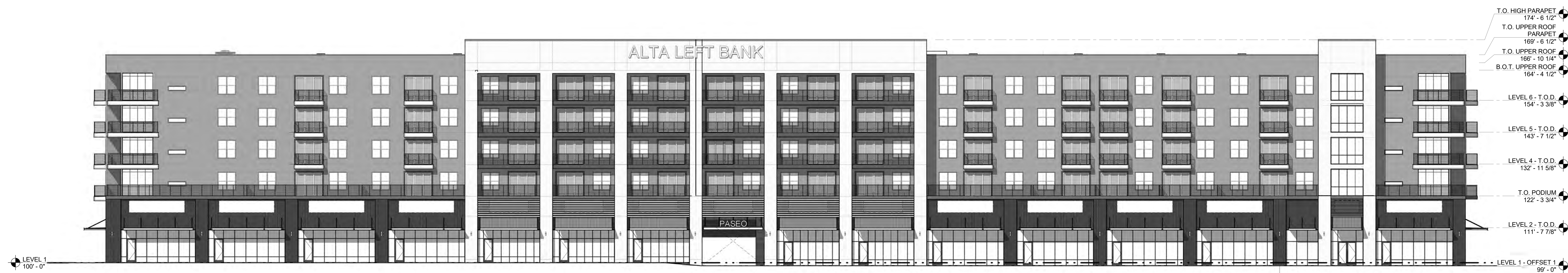
02 SOUTH ELEVATION - OVERALL Scale: 1/16" = 1'-0"